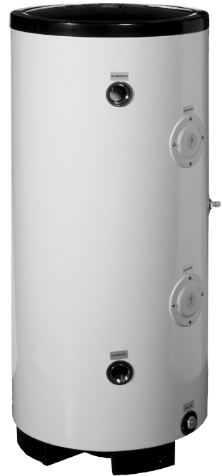
Standard Buffer Tank (No Heat Option)